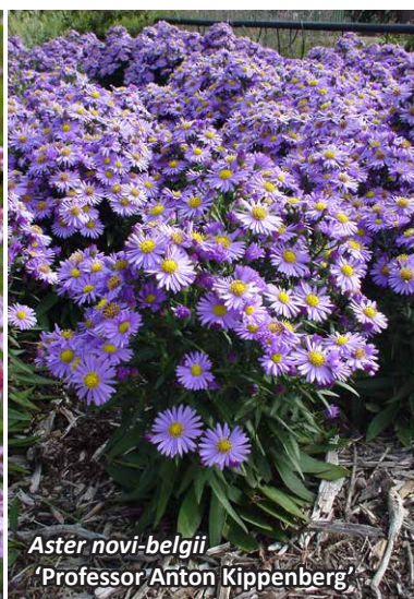
Aster novi-belgii 'Professor Anton Kippenberg'