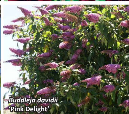
Buddleja davidii 'Pink Delight'