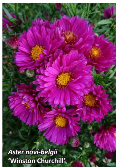
Aster novi-belgii 'Winston Churchill'