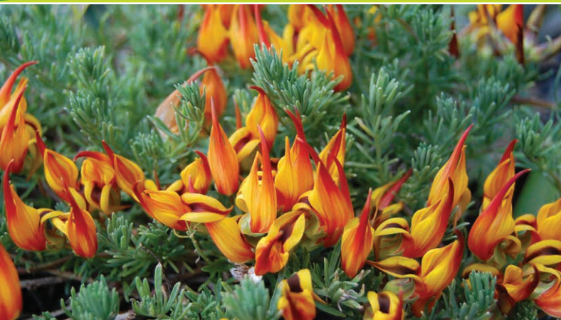
Lotus 'Gold Flash'