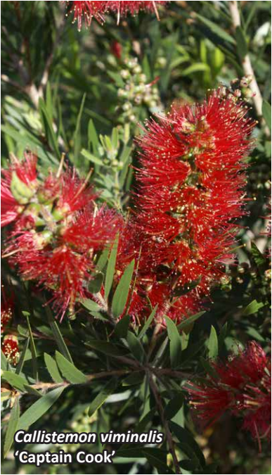
Callistemon viminalis 'Captain Cook'