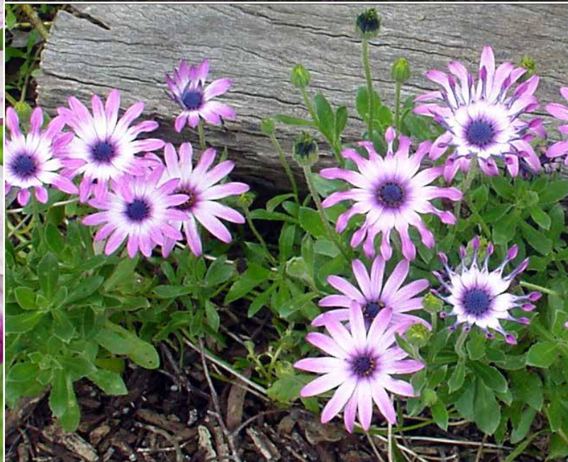
Osteospermum eklonis 'Pink Fairies Wand'