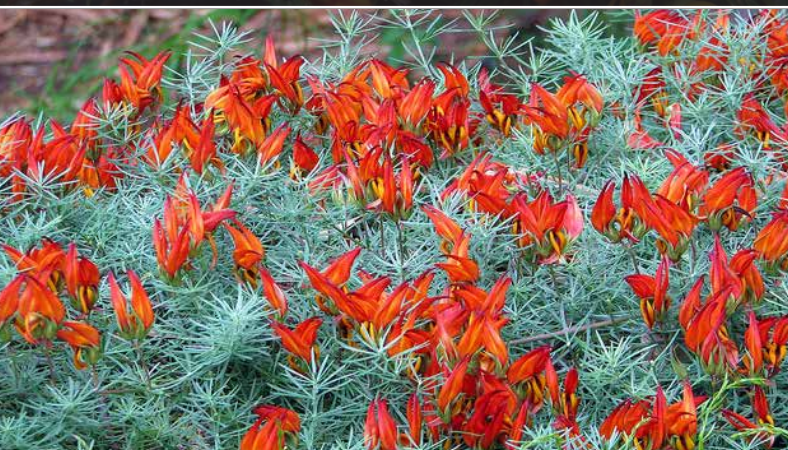
Lotus 'Red Flash'