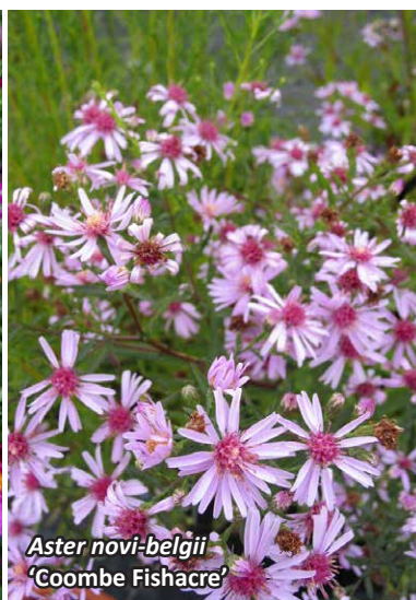
Aster novi-belgii 'Coombe Fishacre'