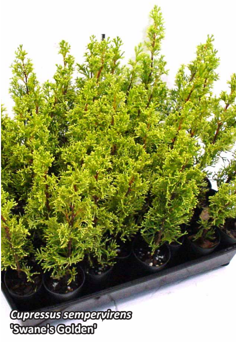
Cupressus sempervirens 'Swane's Golden'