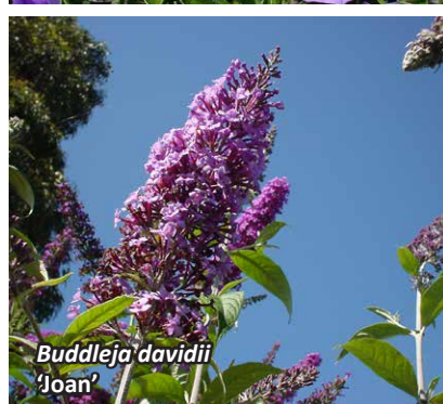
Buddleja davidii 'Joan'