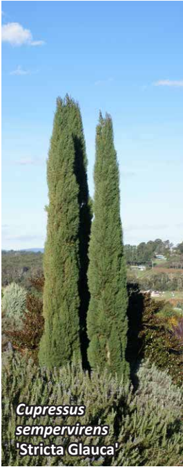
Cupressus sempervirens 'Stricta Glauca'