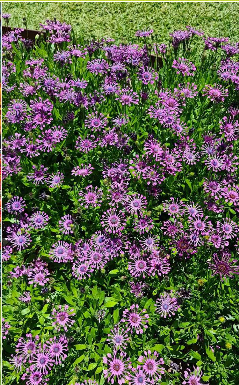
Osteospermum eklonis 'Spider Purple'