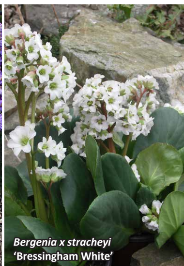
Bergenia x stracheyi 'Bressingham White'