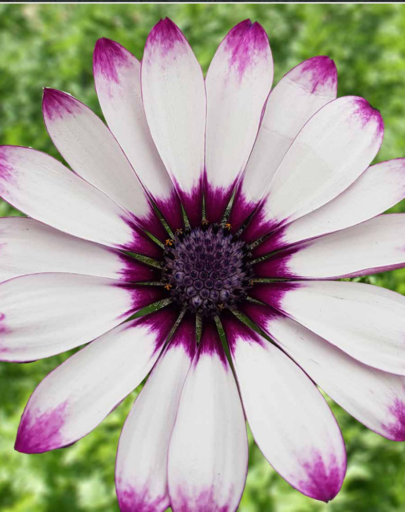
Osteospermum eklonis 'Unicorn'