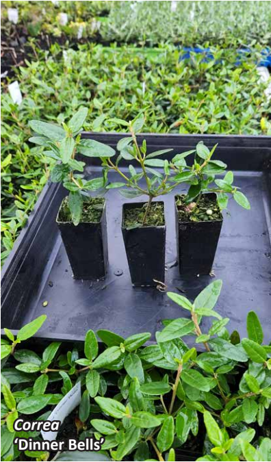
Correa 'Dinner Bells'