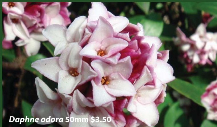
Daphne odora 50mm $3.50

"Preorder your Daphne tubestock now for Spring delivery."