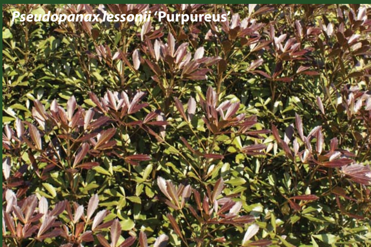
Pseudopanax jessonii 'Purpureus'