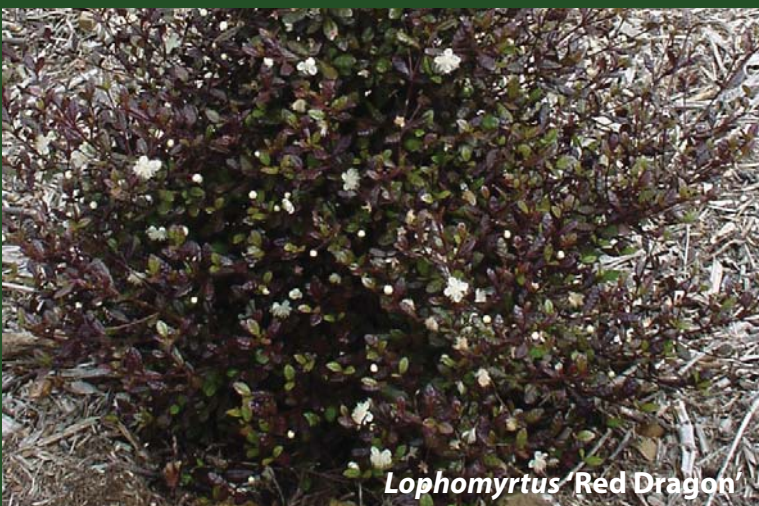
Lophomyrtus 'Red Dragon'