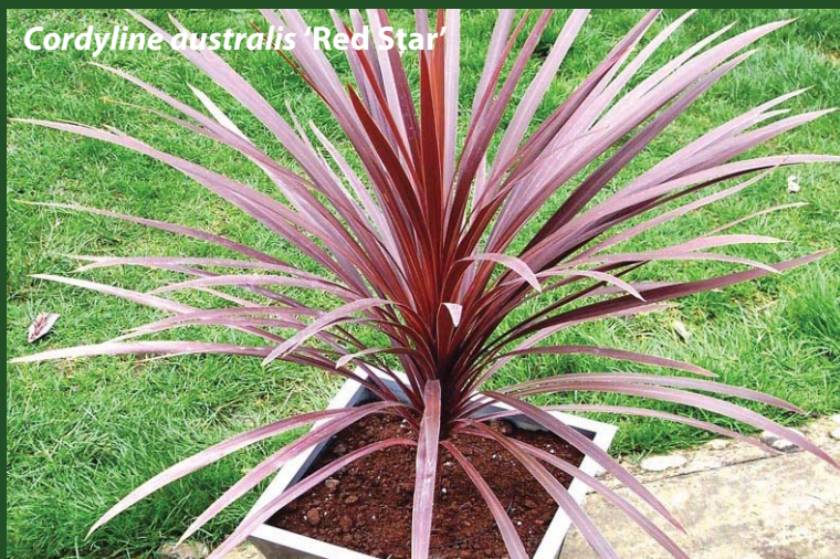
Cordyline australis 'Red Star'