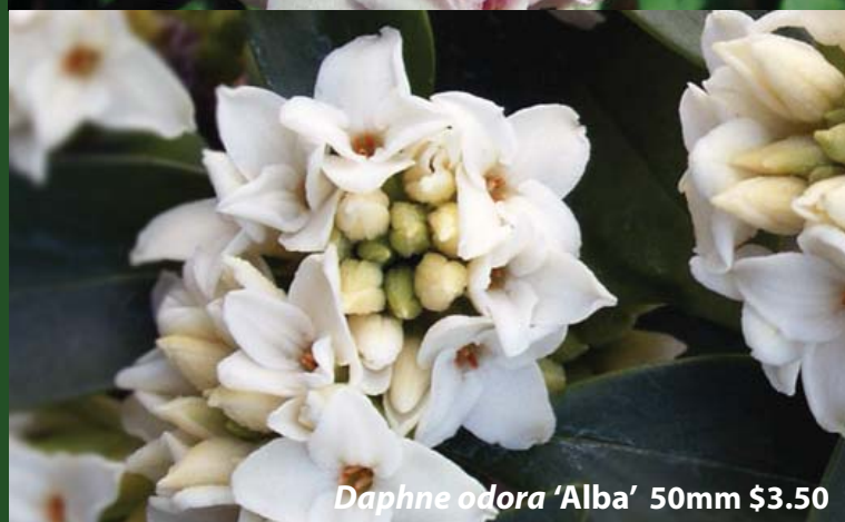
Daphne odora 'Alba' 50mm $3.50