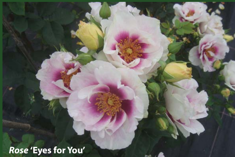
Rose 'Eyes for You'