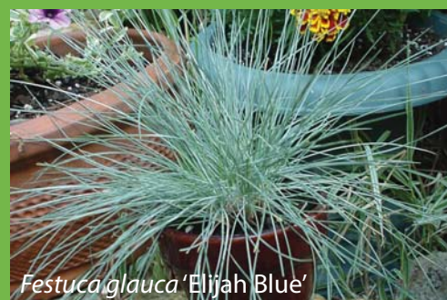
Festuca glauca 'Elijah Blue'