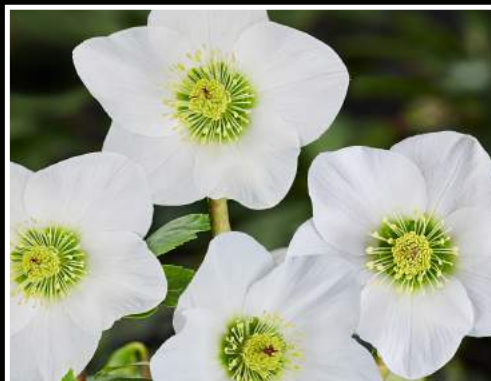
Helleborus x lemperii HGC 'Winter Ballet Lisann' $4.00 + GST + $0.85cent Label

Order these stunning tissue-culture hellebores now for Spring 2024 delivery.