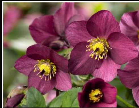
Helleborus x lemperii HGC 'Winter Ballet Karli' $4.00 + GST + $0.85cent Label