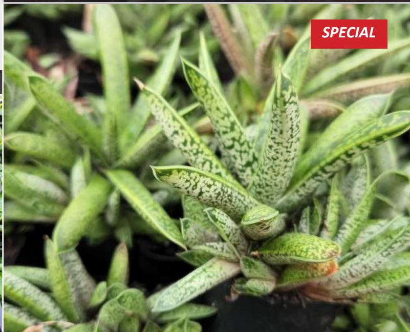
Gasteria obliqua liliputana