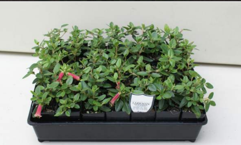
Correa 'Dusky Bells'