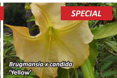
Brugmansia x candida 'Yellow'