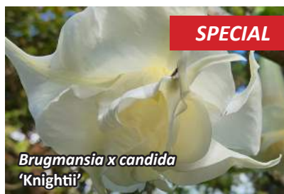
Brugmansia x candida 'Knightii'