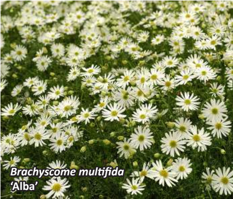
Brachyscome multifida 'Alba'