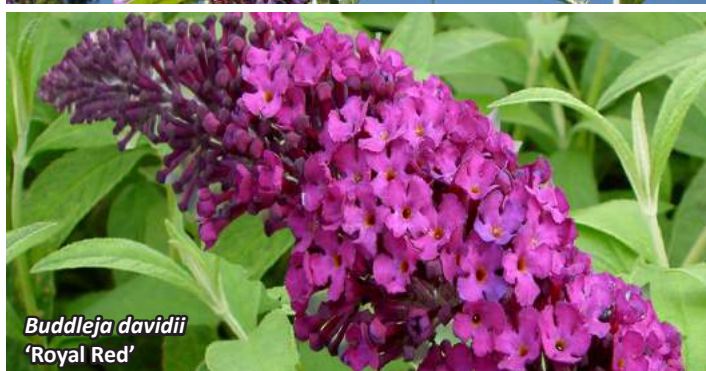
Buddleja davidii 'Royal Red'