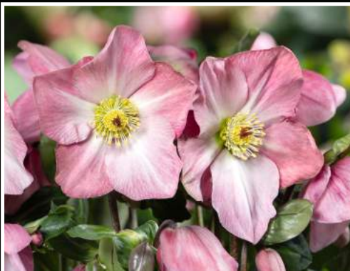
Helleborus x lemperii HGC 'Winter Ballet Katie' $4.00 + GST + $0.85cent Label