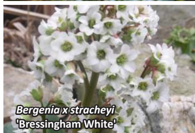
Bergenia x stracheyi 'Bressingham White'