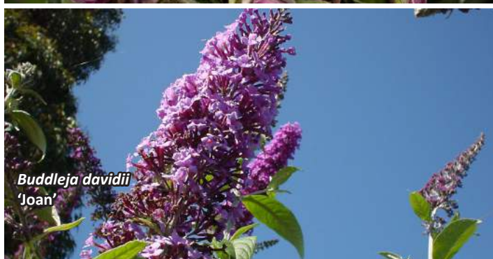
Buddleja davidii 'Joan'