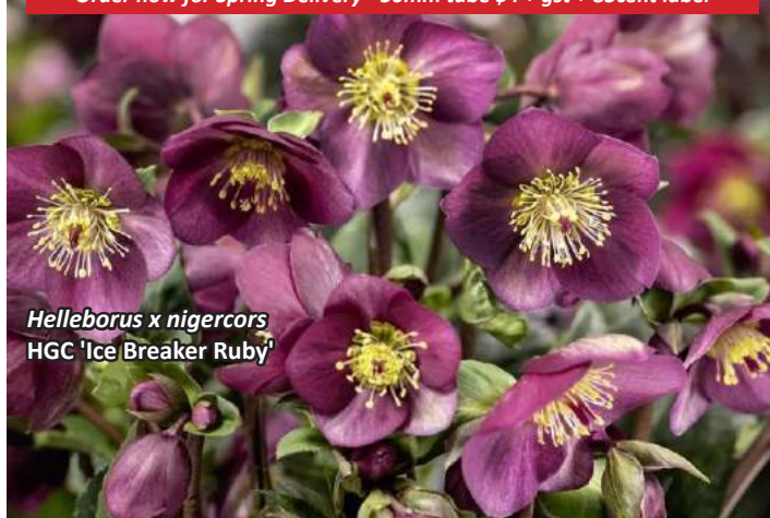
Helleborus x nigercors HGC 'Ice Breaker Ruby'

Order now for Spring Delivery - 50mm tube $4 + gst + 85cent label