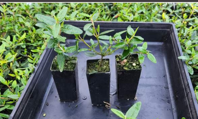
Correa 'Dinner Bells'