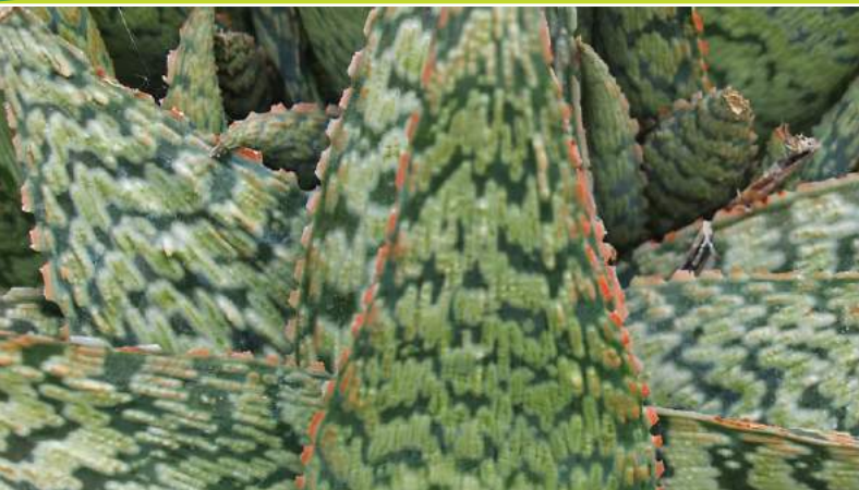
Aloe rauhii 'Cleopatra'