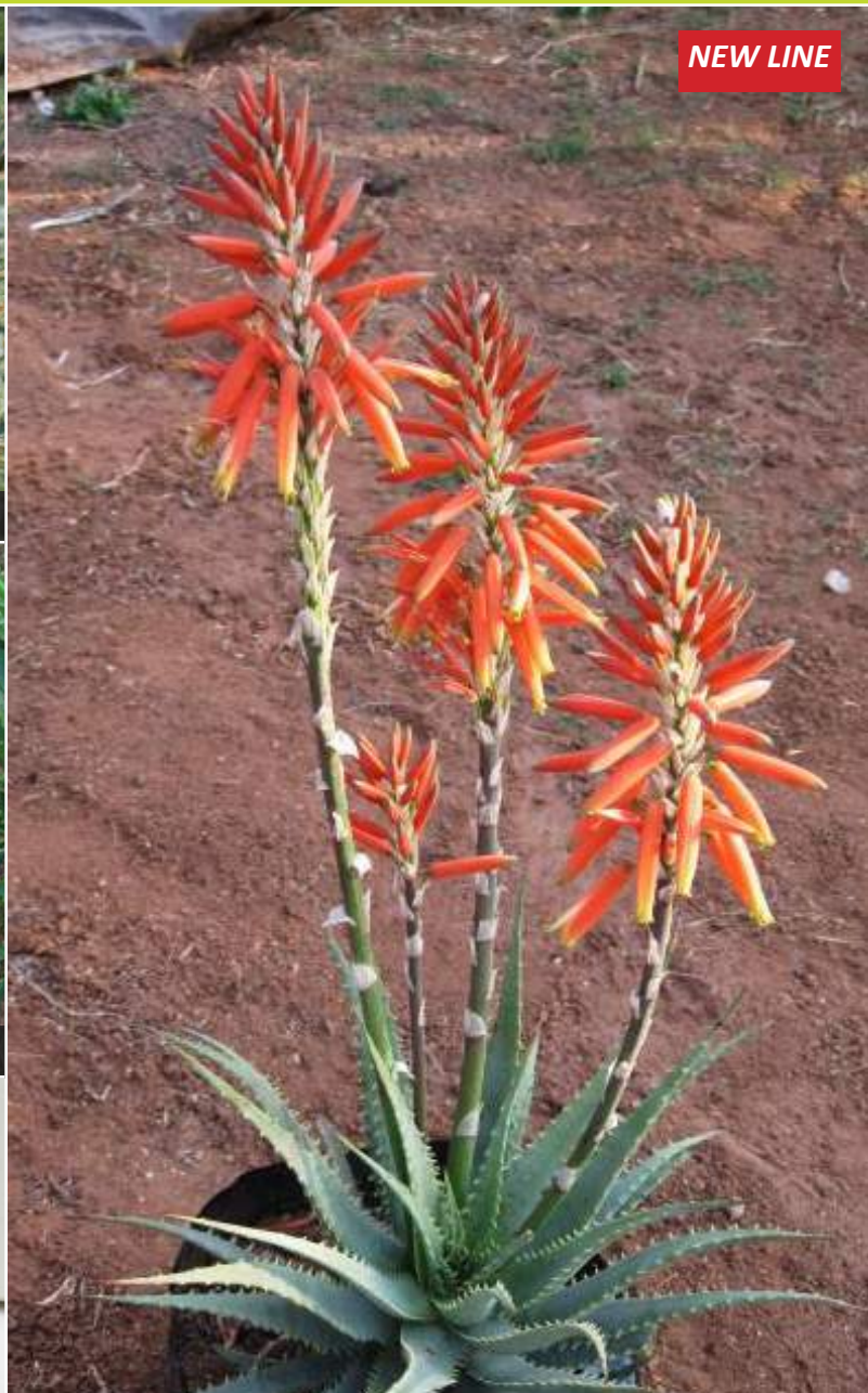
Aloe hybrida 'Supreme Orange'