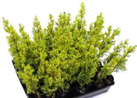
Cupressus sempervirens 'Swane's Golden'