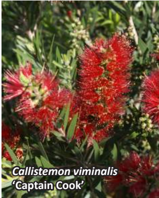
Callistemon viminalis 'Captain Cook'