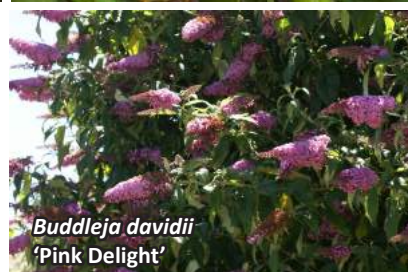
Buddleja davidii 'Pink Delight'