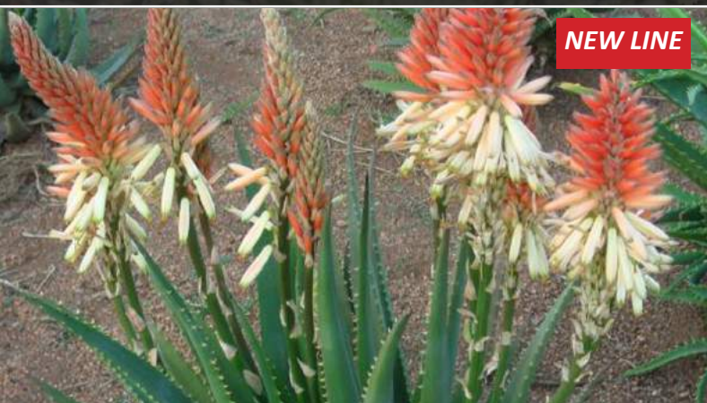
Aloe hybrida 'Supreme Sunset'