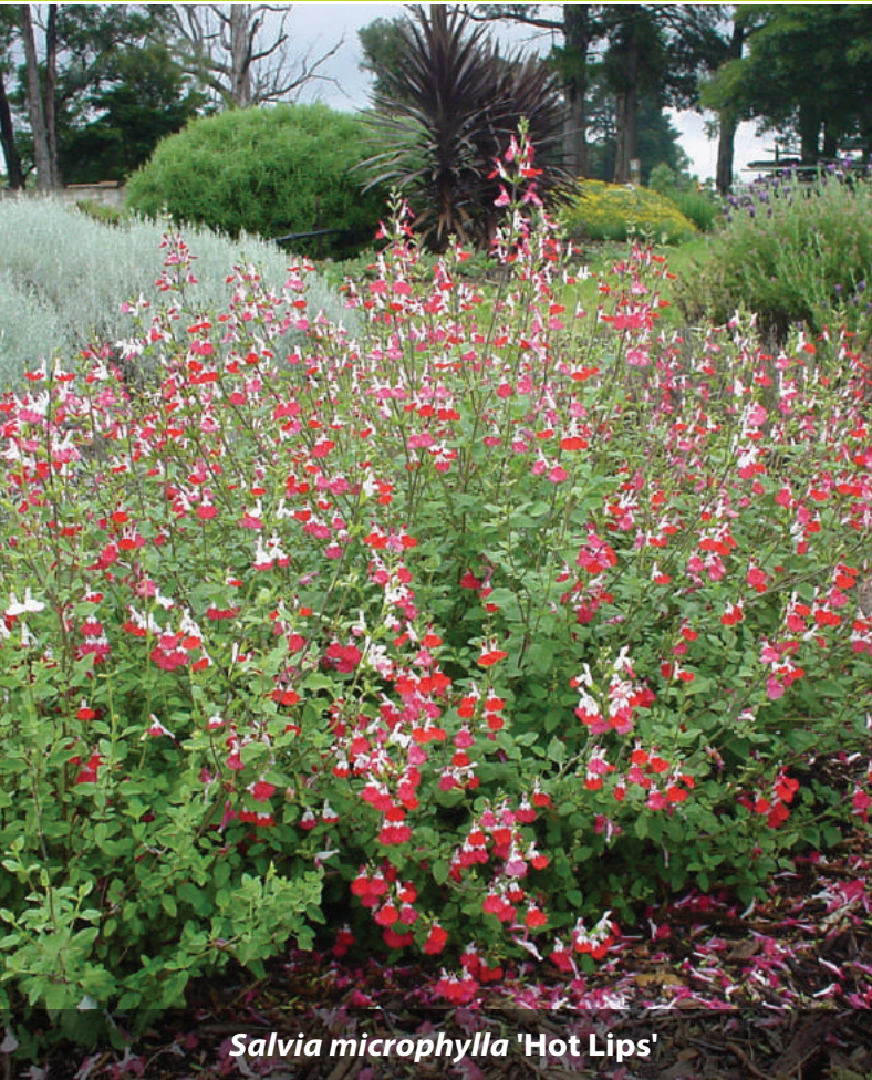
Salvia microphylla 'Hot Lips'