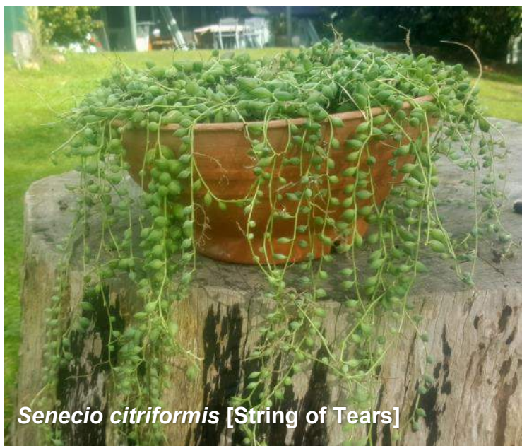
Senecio citriformis [String of Tears]