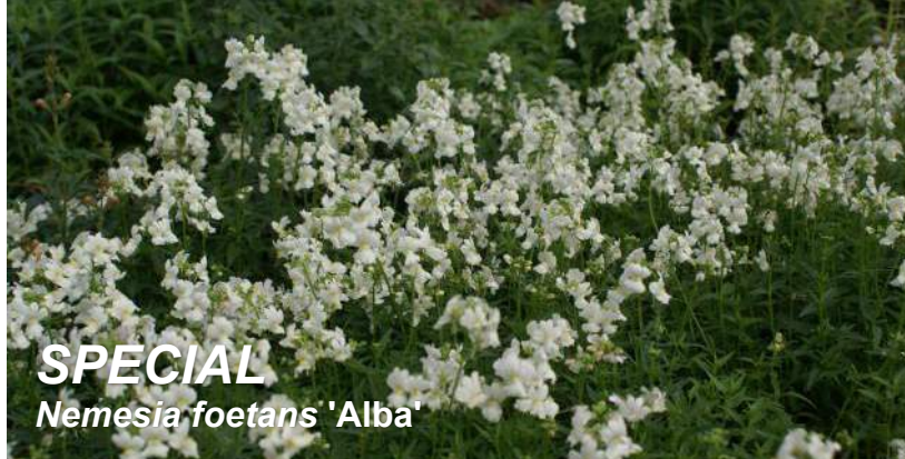
SPECIAL Nemesia foetans 'Alba'