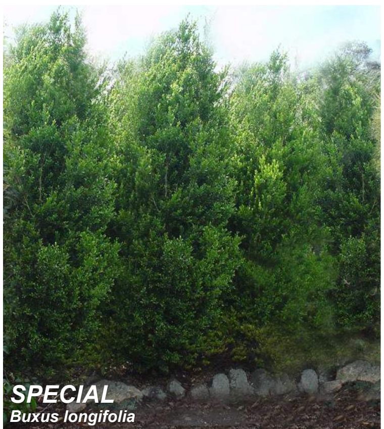
SPECIAL Buxus longifolia