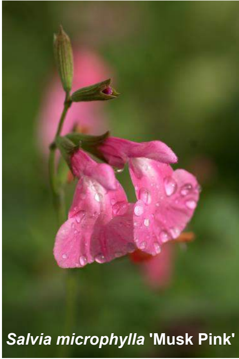
Salvia microphylla 'Musk Pink'