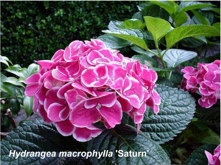
Hydrangea macrophylla 'Saturn'