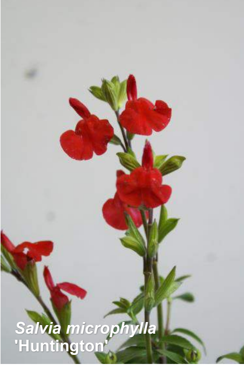
Salvia microphylla 'Huntington'