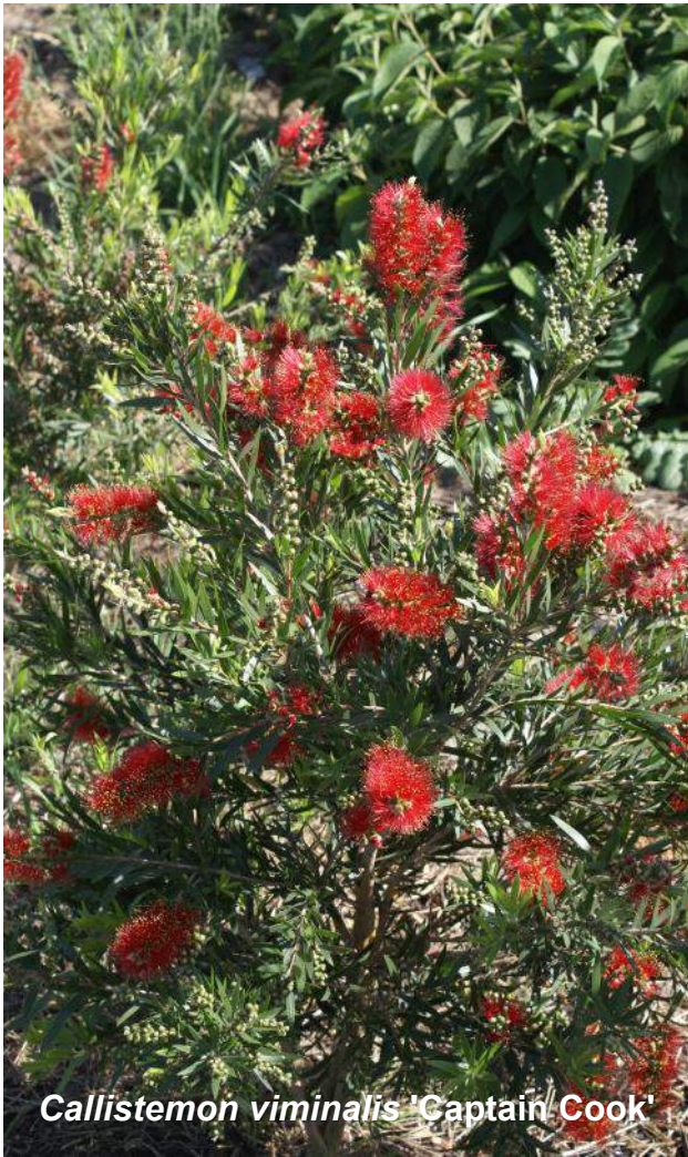
Callistemon viminalis 'Captain Cook'