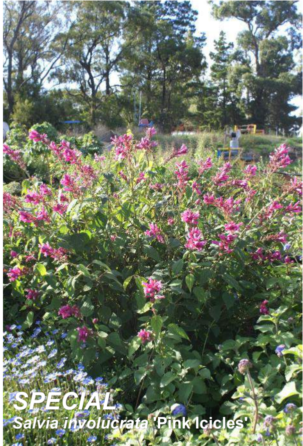
SPECIAL Salvia involucrata 'Pink Icicles'