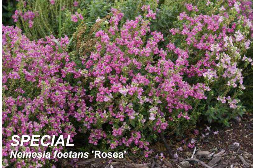
SPECIAL Nemesia foetans 'Rosea'