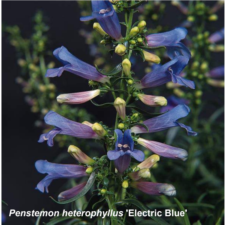
Penstemon heterophyllus 'Electric Blue'