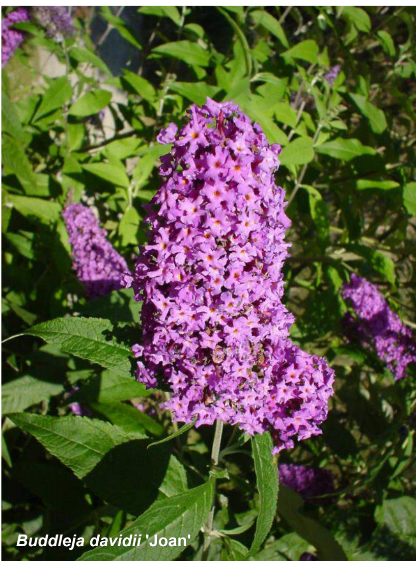
Buddleja davidii 'Joan'