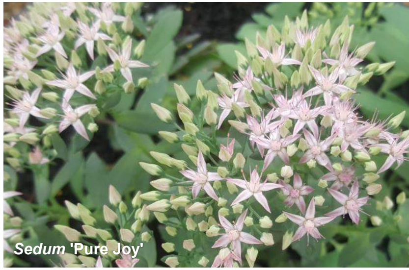
Sedum 'Pure Joy'