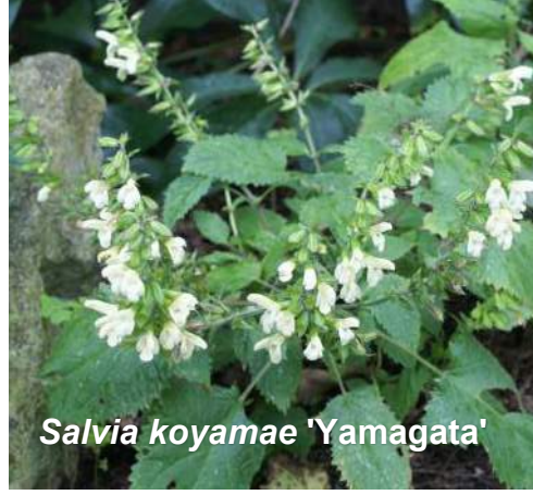
Salvia koyamae 'Yamagata'