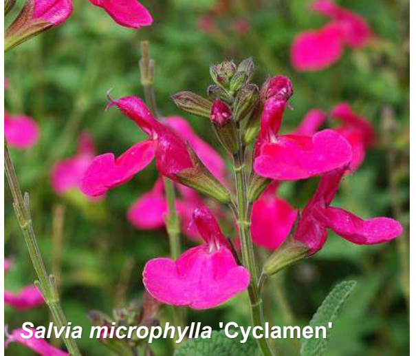
Salvia microphylla 'Cyclamen'