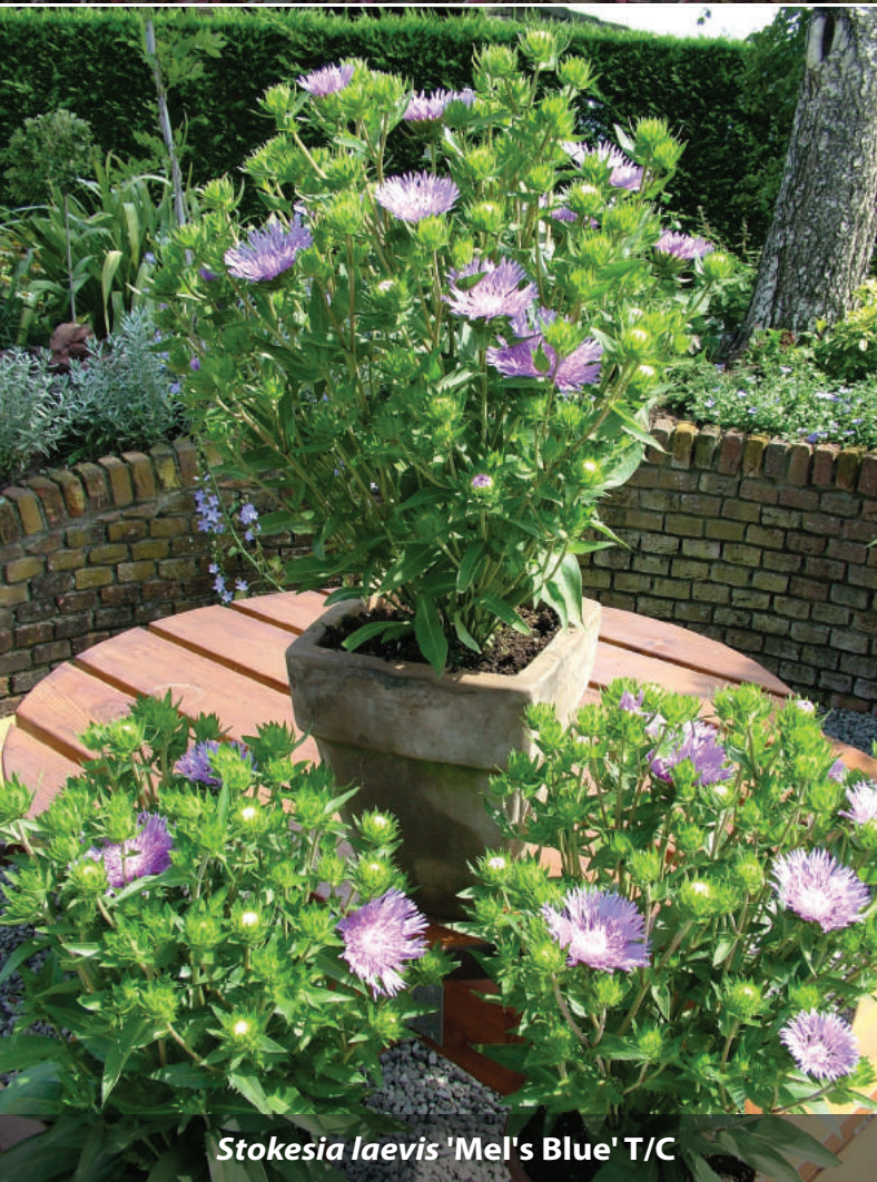
Stokesia laevis 'Mel's Blue' T/C