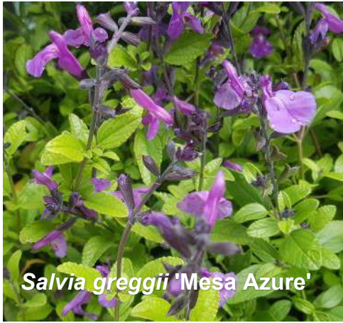
Salvia greggii 'Mesa Azure'