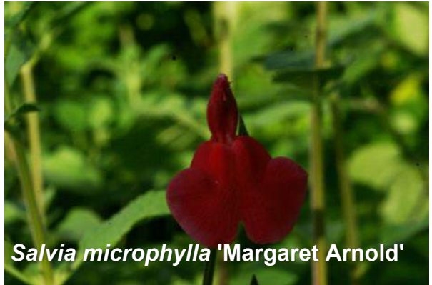
Salvia microphylla 'Margaret Arnold'