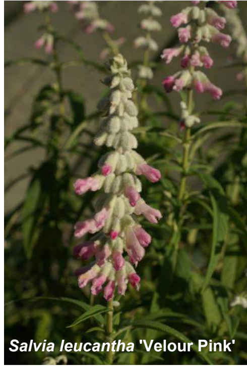
Salvia leucantha 'Velour Pink'