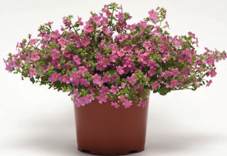
Sutera cordata 'Pinktopia' NEW LINE