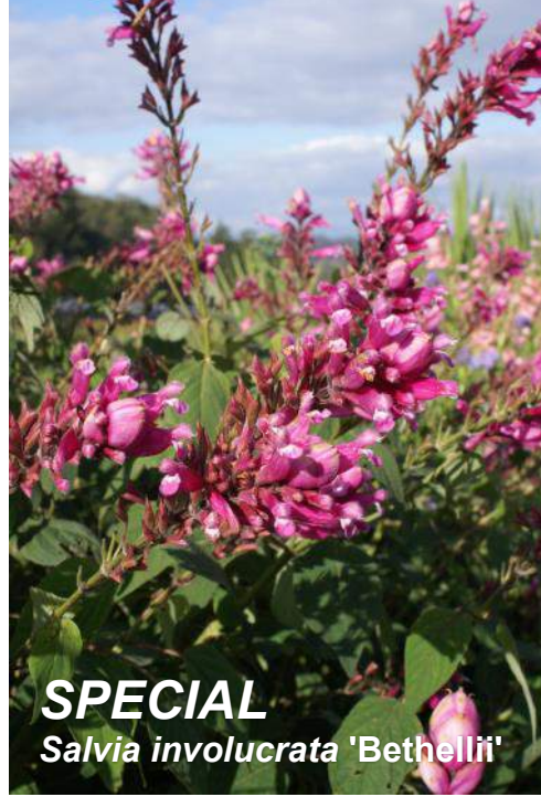
SPECIAL Salvia involucrata 'Bethellii'