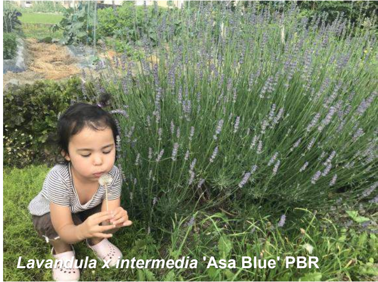
Lavandula X intermedia 'Asa Blue' PBR