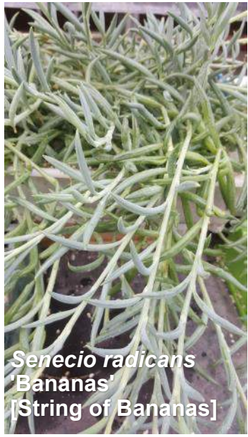
Senecio radicans 'Bananás' [String of Bananas]