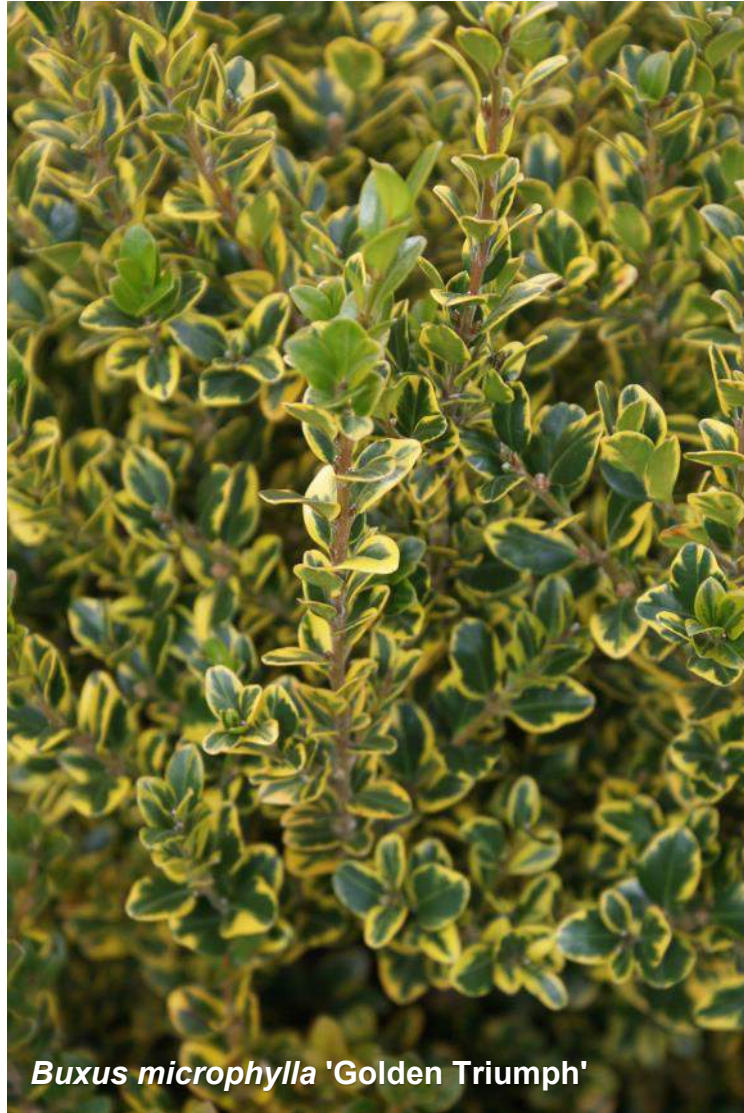
Buxus microphylla 'Golden Triumph'