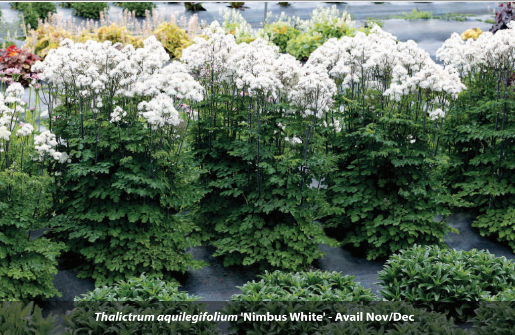
Thalictrum aquilegifolium 'Nimbus White' - Avail Nov/Dec