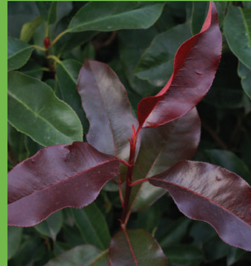
Photinia x fraseri 'Burgundy Beauty'