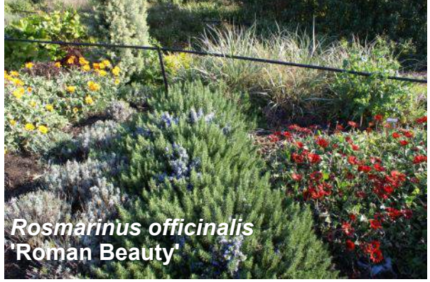
Rosmarinus officinalis 'Roman Beauty'