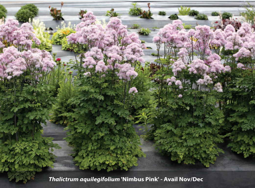
Thalictrum aquilegifolium 'Nimbus Pink' - Avail Nov/Dec