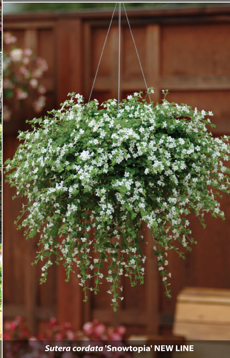
Sutera cordata 'Snowtopia' NEW LINE