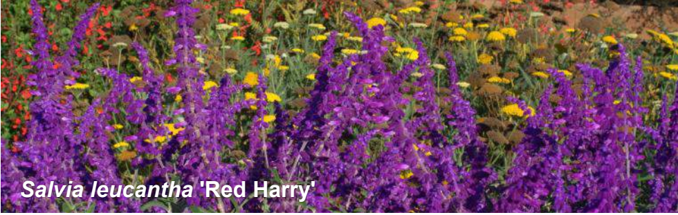
Salvia leucantha 'Red Harry'