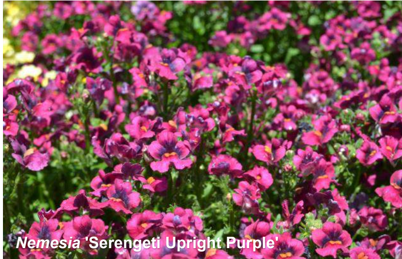
Nemesia 'Serengeti Upright Purple'