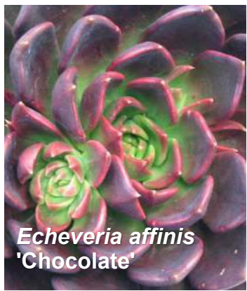
Echeveria affinis 'Chocolate'