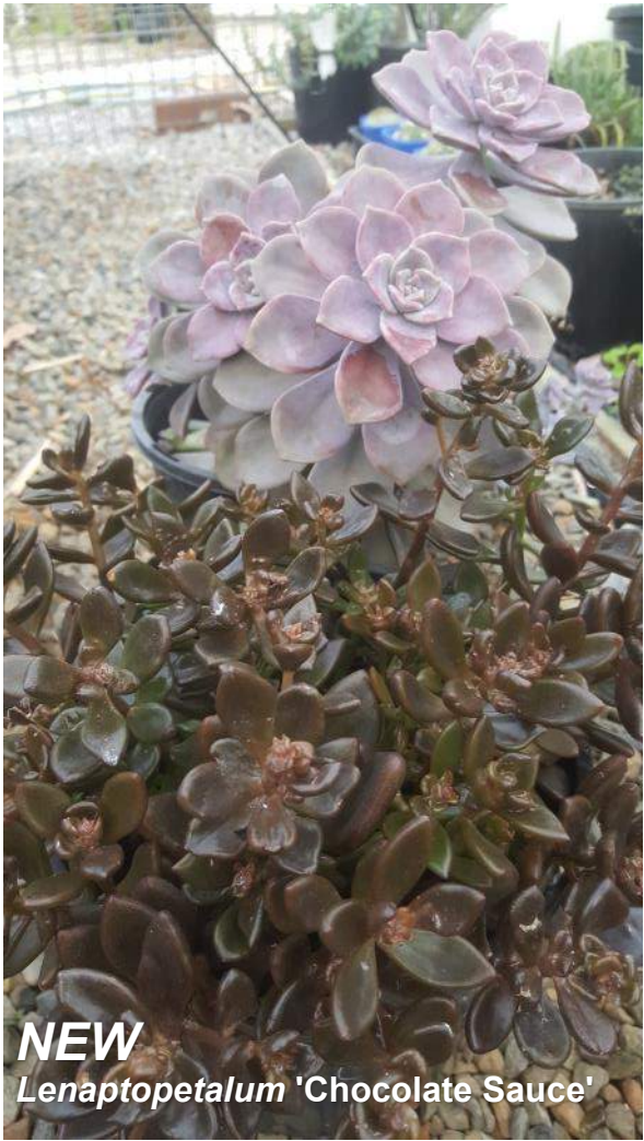
NEW Lenaptopetalum 'Chocolate Sauce'