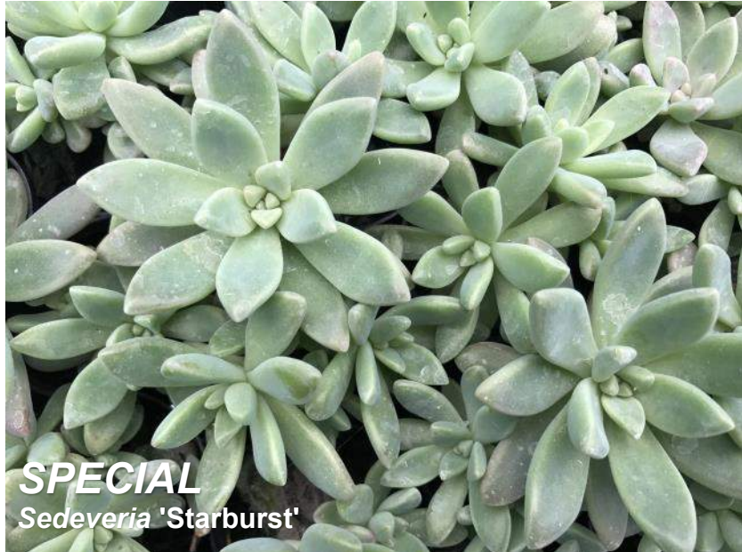
SPECIAL Sedeveria 'Starburst'