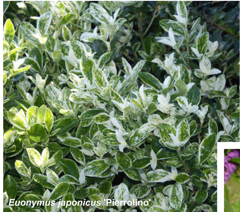
Euonymus japonicus 'Pierrolino'