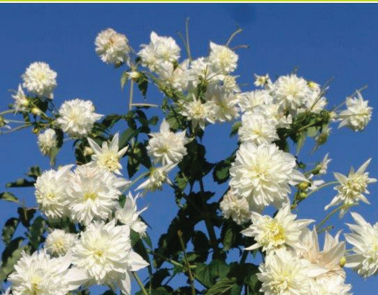
Dahlia imperialis 'Double White' 75mm