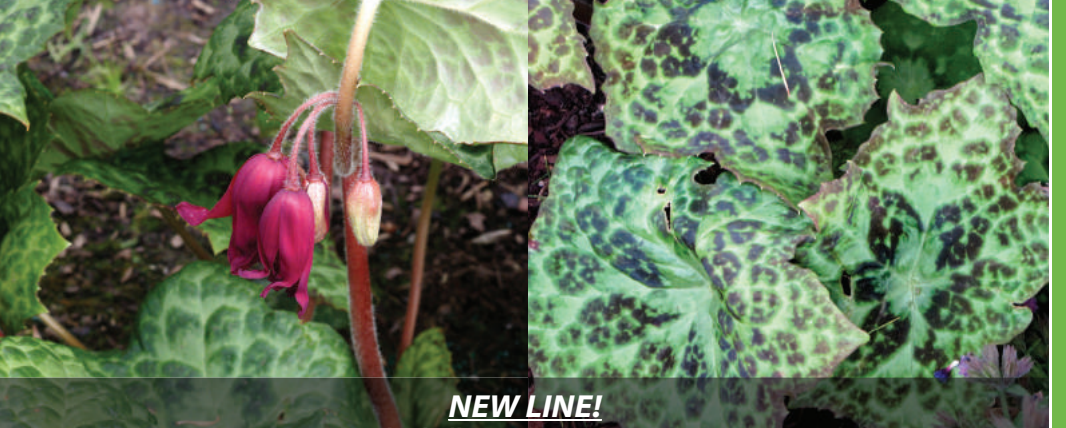
Podophyllum 'Spotty Dotty' T/C