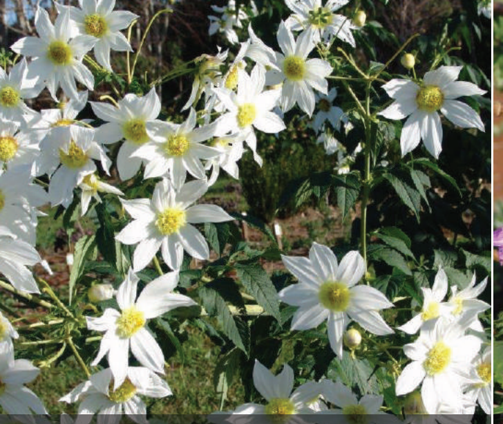
Dahlia imperialis 'White' 75mm