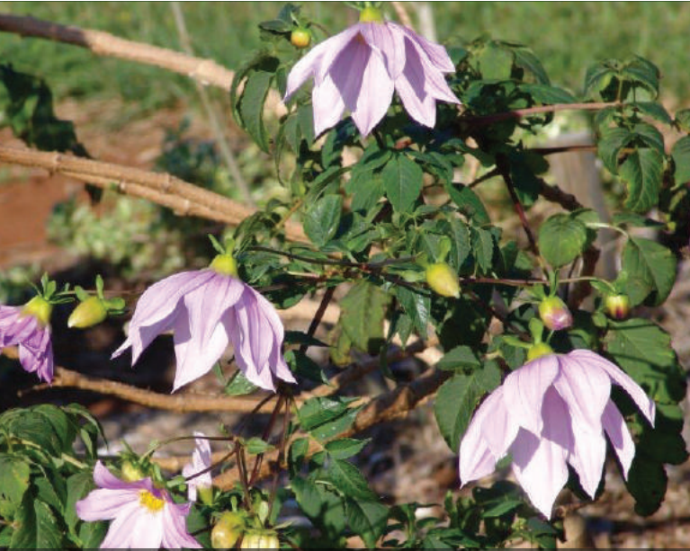
Dahlia imperialis 'Costa Rica' 75mm