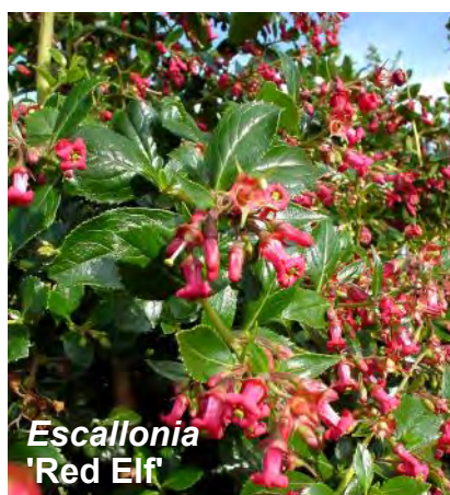
Escallonia 'Red Elf'