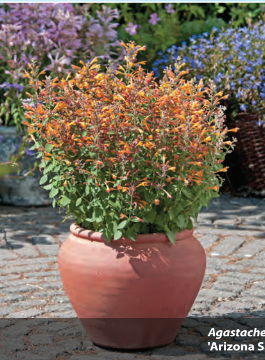
Agastache x hybrida 'Arizona Sandstone'