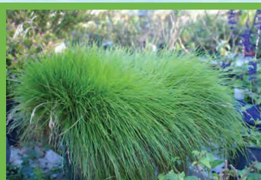
Deschampsia caespitosa 'Tatra Gold'