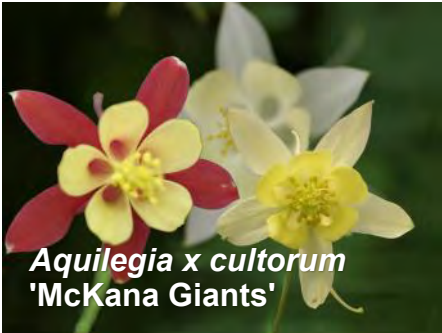
Aquilegia x cultorum 'McKana Giants'