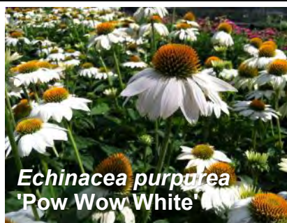
Echinacea purpurea 'Pow Wow White'