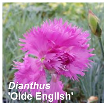
Dianthus 'Olde English'