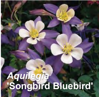
Aquilegia 'Songbird Bluebird'