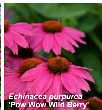
Echinacea purpurea 'Pow Wow Wild Berry'