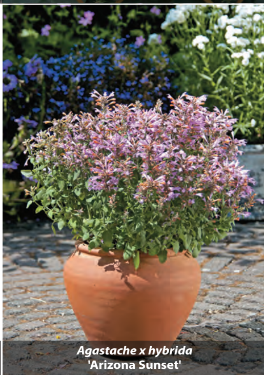
Agastache x hybrida 'Arizona Sunset'