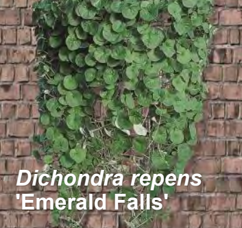
Dichondra repens 'Emerald Falls'