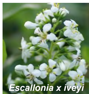
Escallonia x iveyi