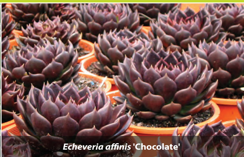
Echeveria affinis 'Chocolate'