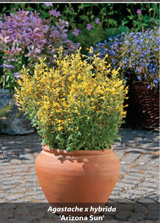
Agastache x hybrida 'Arizona Sun'