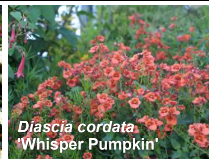
Diascia cordata 'Whisper Pumpkin'