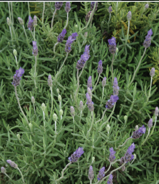
Lavandula dentata 'Monet'