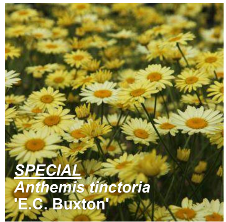
SPECIAL Anthemis tinctoria 'E.C. Buxton'