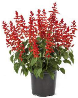
Salvia splendens 'Grandstand Red'