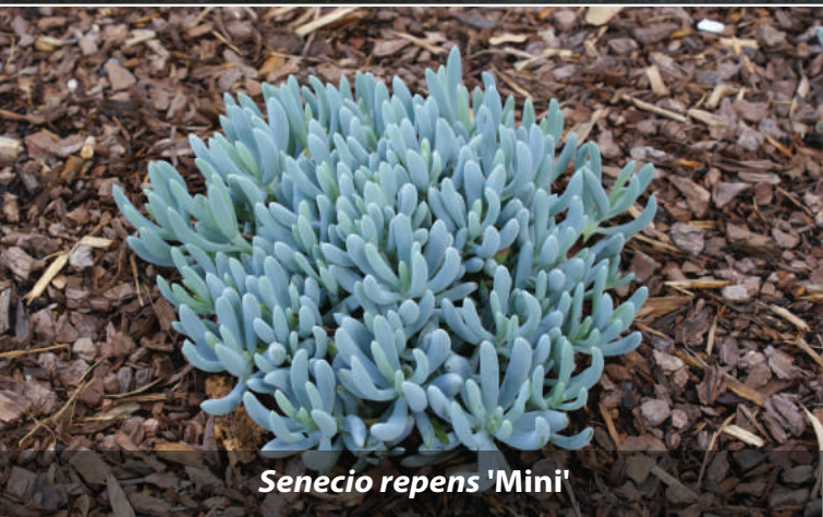
Senecio repens 'Mini'