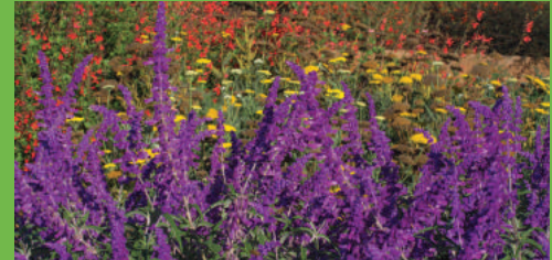
SPECIAL - Salvia leucantha 'Red Harry'