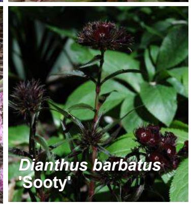
Dianthus barbatus 'Sooty'