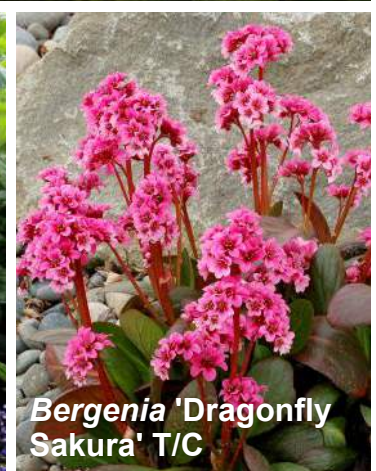
Bergenia 'Dragonfly Sakura' T/C