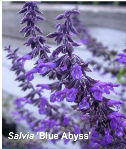
Salvia 'Blue Abyss'