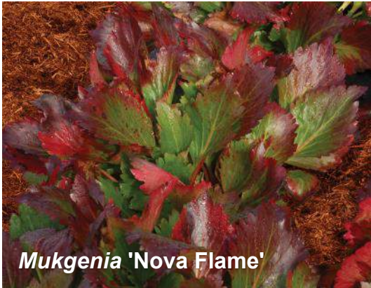
Mukgenia 'Nova Flame'