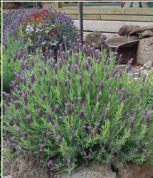
Lavandula 'Sugar Plum'