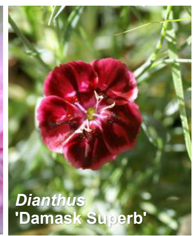
Dianthus 'Damask Superb'