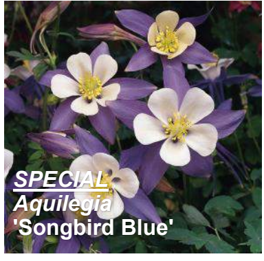
SPECIAL Aquilegia 'Songbird Blue'