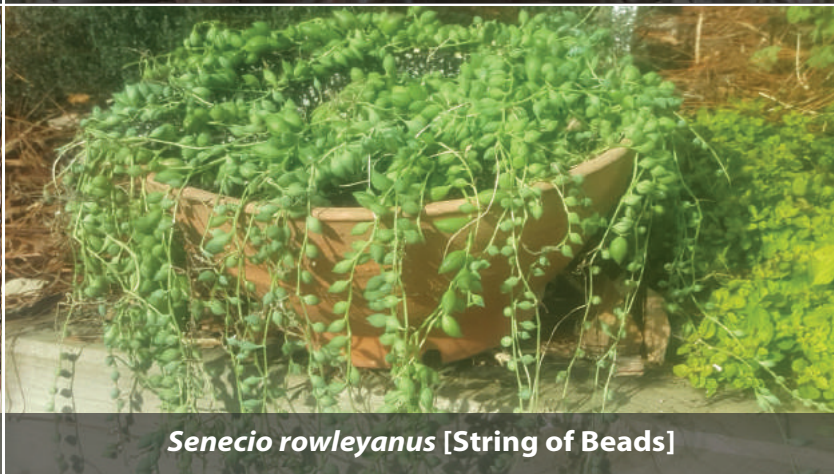
Senecio rowleyanus [String of Beads]