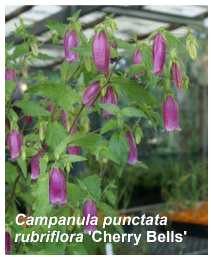
Campanula punctata rubriflora 'Cherry Bells'