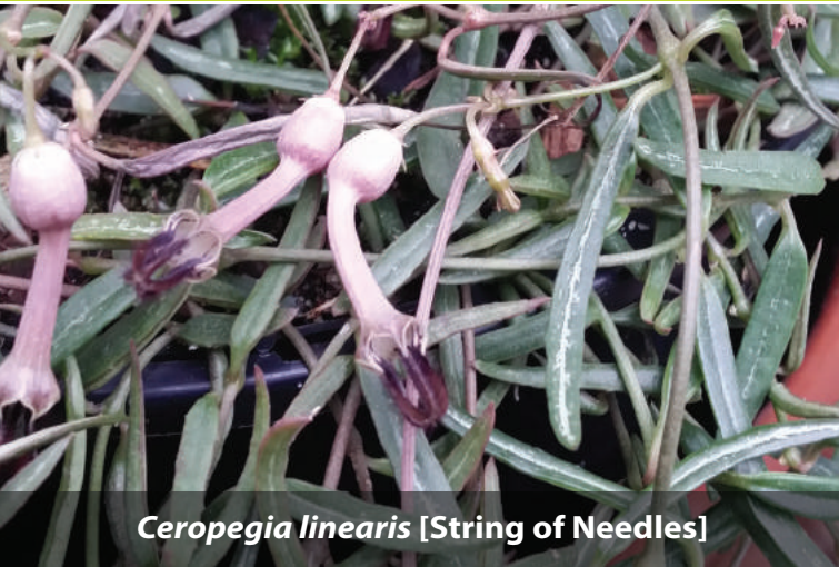
Ceropegia linearis [String of Needles]