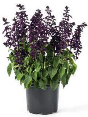
Salvia splendens 'Grandstand Purple'