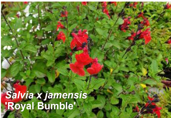
Salvia x jamensis 'Royal Bumble'