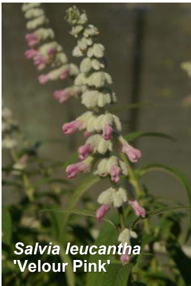
Salvia leucantha 'Velour Pink'