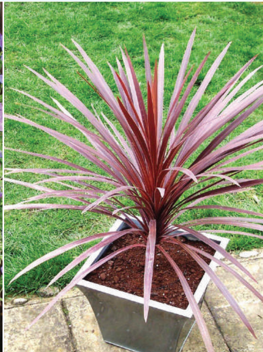
Cordyline australis 'Red Star' 105 cell