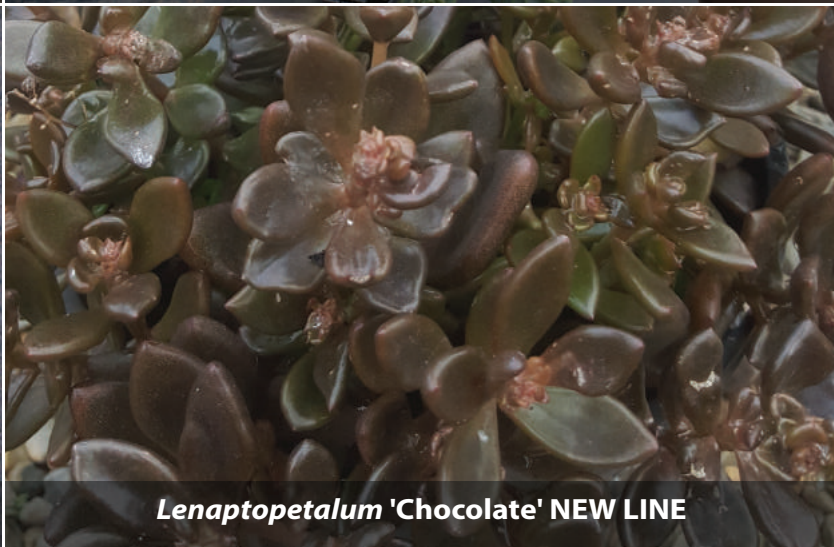
Lenaptopetalum 'Chocolate' NEW LINE