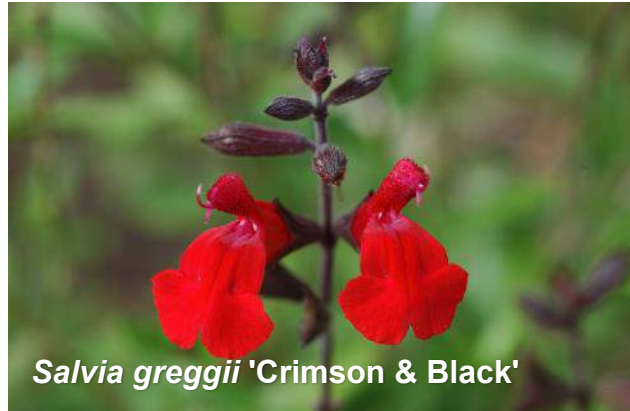
Salvia greggii 'Crimson & Black'