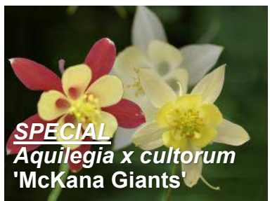
SPECIAL Aquilegia x cultorum 'McKana Giants'