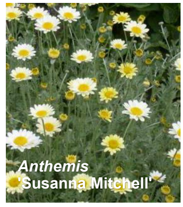
Anthemis 'Susanna Mitchell'