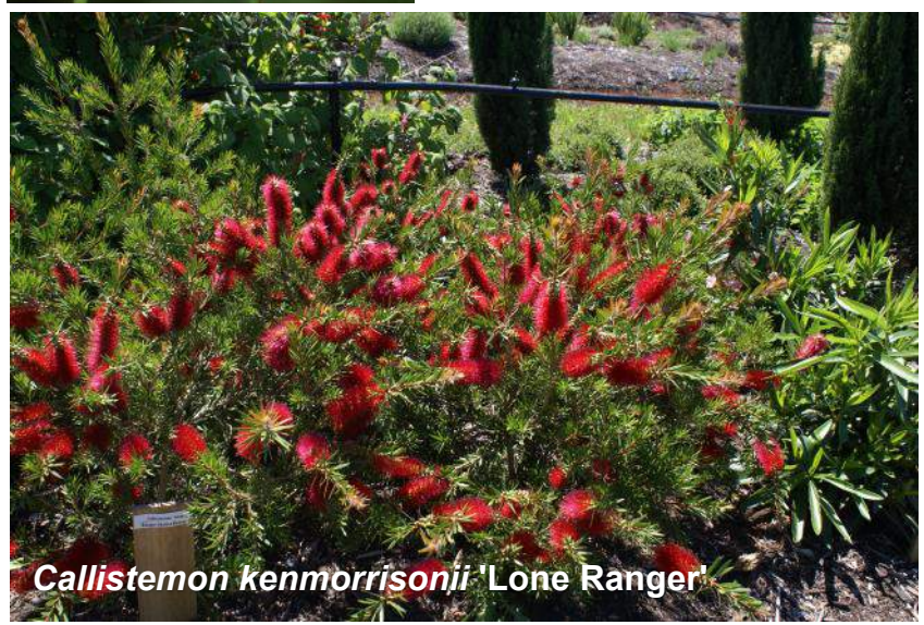
Callistemon kenmorrisonii 'Lone Ranger'