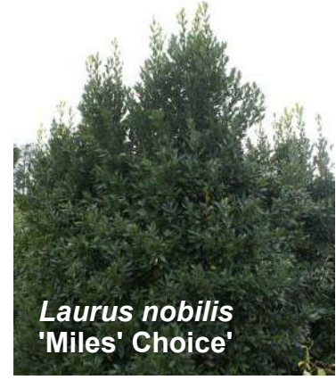
Laurus nobilis 'Miles' Choice'