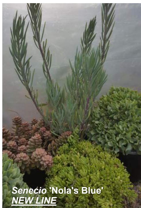
Senecio 'Nola's Blue' NEW LINE