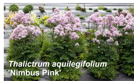
Thalictrum aquilegifolium 'Nimbus Pink'