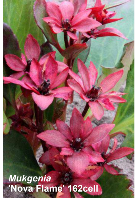
Mukdenia 'Nova Flame' 162cell