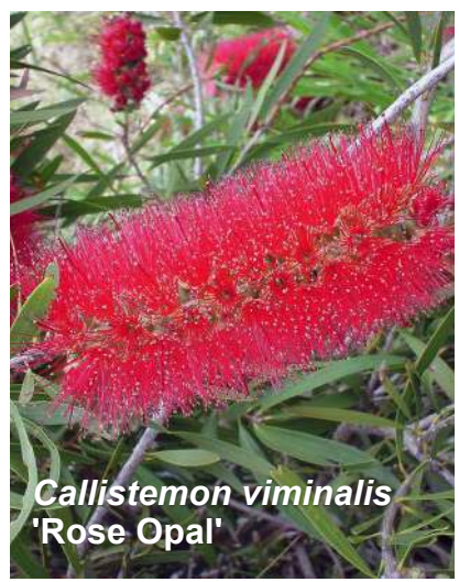
Callistemon viminalis 'Rose Opal'