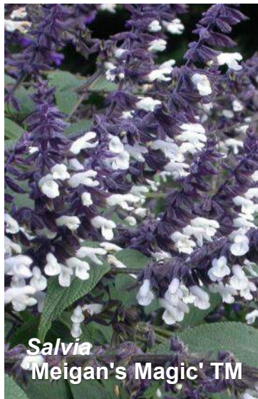
Salvia 'Meigan's Magic' TM