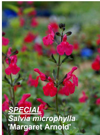
SPECIAL Salvia microphylla 'Margaret Arnold'