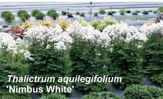
Thalictrum aquilegifolium 'Nimbus White'