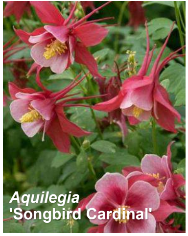
Aquilegia 'Songbird Cardinal'