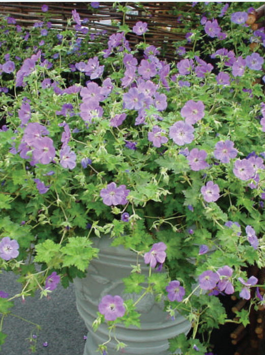
Geranium 'Rozanne' PBR T/C