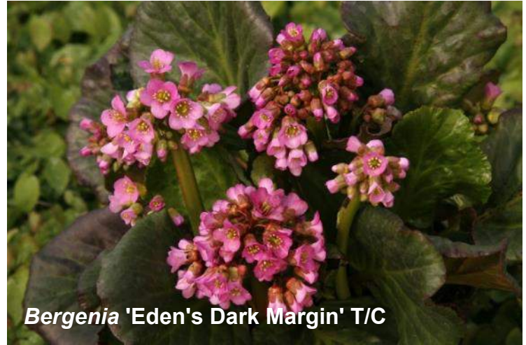
Bergenia 'Eden's Dark Margin' T/C