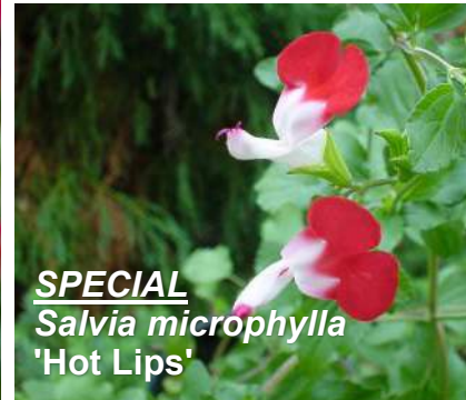
SPECIAL Salvia microphylla 'Hot Lips'